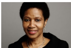
Phumzile Mlambo-Ngcuka United Nations Under-Secretary-General and Executive Director, UN Women