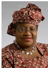
Ngozi Okonjo-Iweala former Minister of Finance, Nigeria