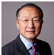
Jim Yong Kim President, World Bank Group