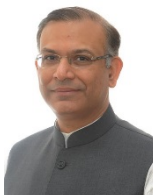
Jayant Sinha Minister of State for Finance, India