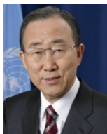
Ban Ki-moon Secretary General, United Nations